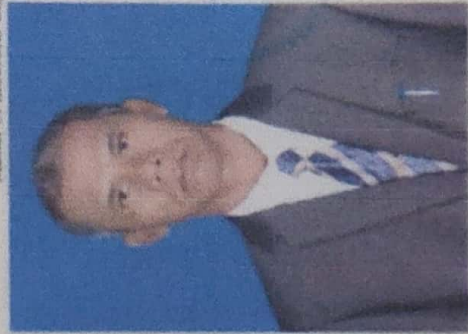
Jakarta, 19 Februari 2016 Jakarta, February 19, 2016